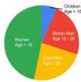
Figure 2: Demographics of Interviewees

Regularly available clean water has profound impacts on both economic and social life. In Ghana, reducing water fetching times has been linked to increased school attendance among girls, who no longer have to miss school to collect water 7 . Similarly, in Cambodia, providing safe drinking water through RWH systems has reduced absenteeism among schoolchildren during the dry season 8 .