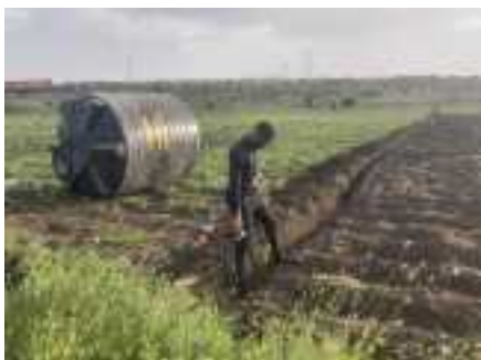
Figure 7: Water Harvesting Irrigation [completed Feb 2023]

communities like the Maasai cope with climate change and land degradation challenges. It is essential to acknowledge that many challenges still need to be addressed to ensure the sustainability of such solutions and interventions. By taking a holistic approach and involving the community in the planning and implementing such interventions, the benefits are long-lasting and contribute to the overall well-being and resilience of the community. In light of these findings, the program will continue to expand its impact via multiple projects: a subsidiary program that scales to 1000+ Maasai families [Bomas] impacting 15,000 population, additional filtration system for smaller dams, and placing more water harvesting units over the Monduli district, aimed at expanding the reach of these interventions and improving the livelihoods of 30,000 Maasai people in Monduli, Arusha region.