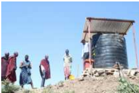
Figure 6: Water Filtration [completed Feb 2023]