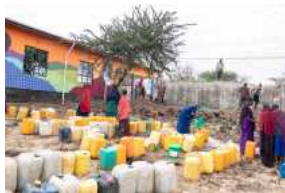
Figure 1: 100k Liter Water Harvesting Unit [Completed June 2022]

Taneja and Yuvraj Taneja fundraised $20k in 2021 to contribute to this ini- tiative. Maji Wells used local contractors