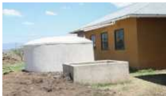
Figure 5: Water Harvesting Unit of 40k Litres [completed Feb 2023]

a significant impact on the daily lives and well-being of the Maasai people. Policymakers and practitioners should consider the potential benefits of such interventions when designing programs to address water scarcity and improve the livelihoods of communities in similar contexts. A plan is being developed to introduce a universal water harvesting unit. The current water harvesting unit contains 100,000 liters when full. It would empty 3-4 days later, especially if all the members of the villagers depended on it. However, it is essential to note that the effectiveness of the water harvesting unit may depend on factors such as its proximity to households, the quality of the water collected, and the maintenance and upkeep of the unit over time. These factors should be considered when evaluating the impact of water harvesting units on the lives of the Maasai people.