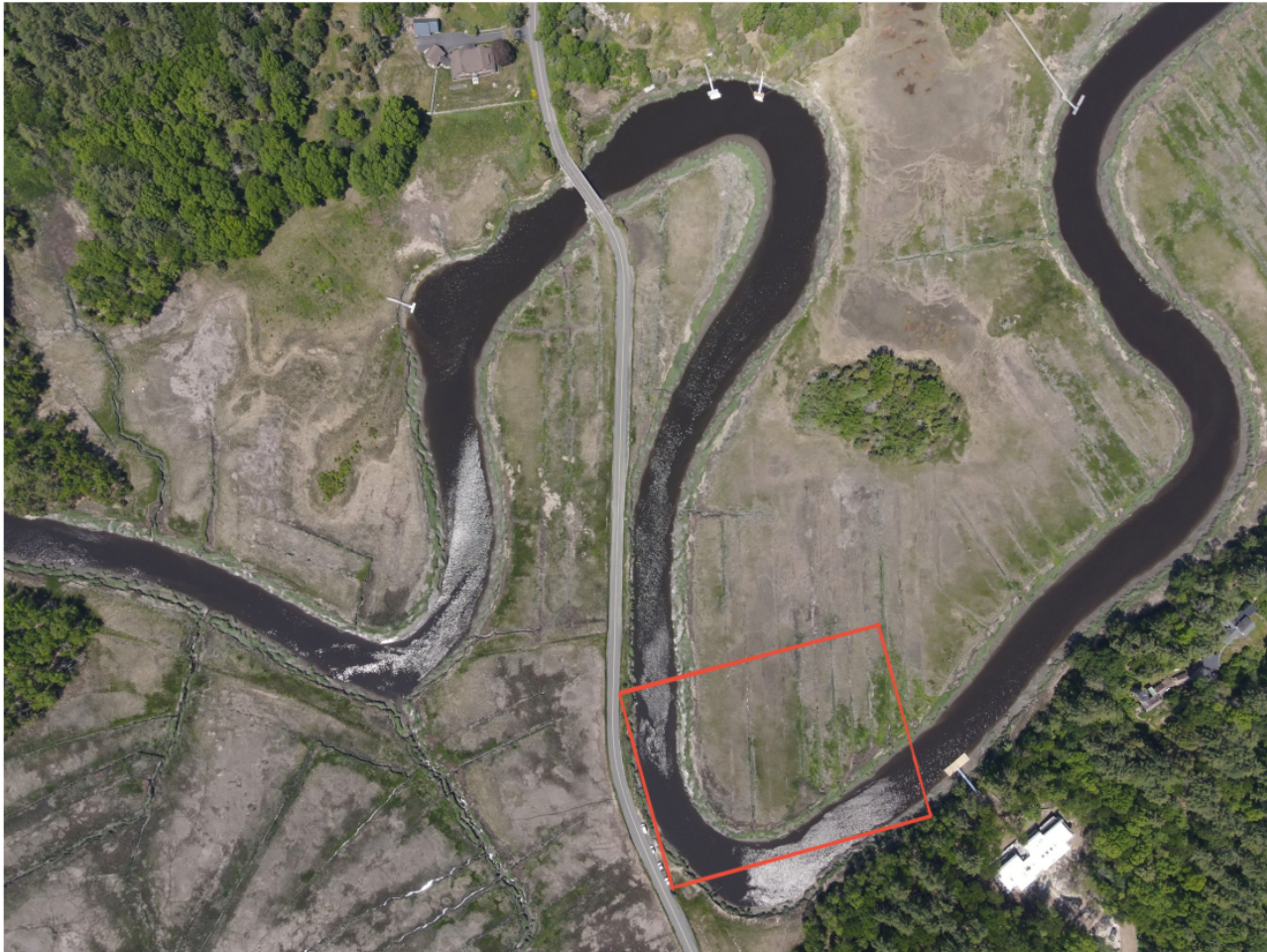
Fig. 1 Aerial drone image of case study site in Byfield, Massachusetts, traced in red

invasive plants, including competition with native species, disruption of ecological functions, habitat degradation, and the broader influence on economic, cultural, and ecological balance 32 . The ever-increasing interconnectedness of our modern world has facilitated the introduction of species to wider ranges of land than ever before, rendering numerous areas susceptible to invasion 33 . Moreover, modern environmental crises including climate change, habitat destruction, and pollution continue to intensify invasive species' impact 34 .