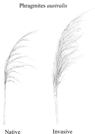
Fig. 2 Phragmites australis inflorescence comparison, Source: Yiqiao Wang, inspired by 36

peting native wetland species, P. australis demonstrates higher rates of nitrogen, urea, and amino acid assimilation 38 . Additionally, P. australis has a pronounced affinity for ammonium ( \text{NH}_4^+ ), distinguishing it from other wetland plants 25 . This adaptability enables P. australis to thrive in both nutrient-starved and nutrient-rich environments, including those with high salinity, making salt marshes particularly favorable for its growth.